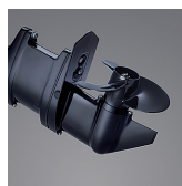
HIGH THRUST PROPELLER