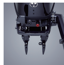
LARGER CARRYING HANDLE (FRONT)