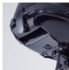
HOLDING GRIP (REAR)