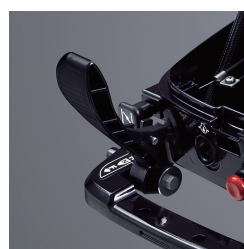
FRONT SHIFT LEVER